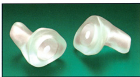
FIGURE 1. Musicians Earplugs™ are custom deep-fitting earmolds that have a diaphragm and a specific volume of the air in the sound bore. This combination is designed to replicate the resonance of the normal ear, resulting in smooth, flat attenuation of sound across frequencies. Interchangeable attenuators within the plugs provide the option of 9 dBA, 15 dBA, or 25 dBA noise reduction.

al exposure level of 85 dB), the same person could be in a 95 dBA environment for 8 hours per day, 5 days a week.