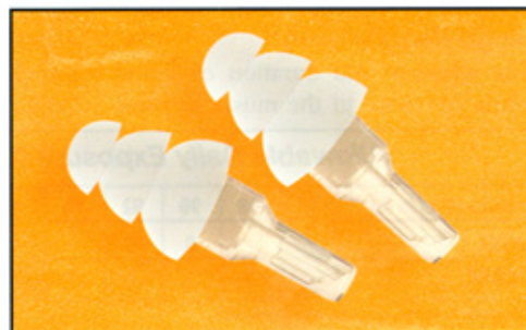
FIGURE 3. The ER-20, jointly developed by Etymotic Research and Aearo Corp, is designed as a "catch-all" affordable non-custom earplug that provides 20 dB of flat attenuation for musicians.